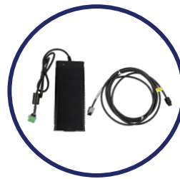
Power supply & valve connecting cable (4.5 m) included.